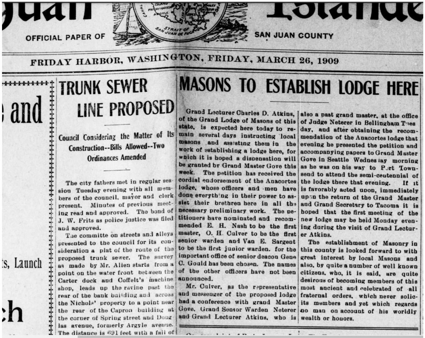
March 1909 Established - San Juan Islander